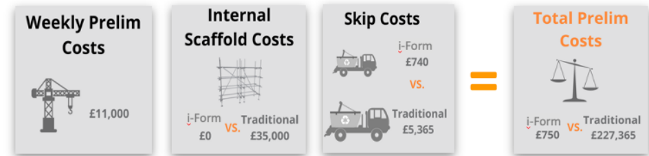
Site Prelim Costs – MFS i-Form Solution vs Traditional